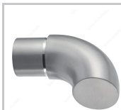
Stainless Steel 316