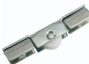
Wheel 147 for Showcase Track Series 146