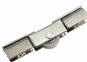
Metal Ball-Bearing Roller with Silent Nylon Wheel