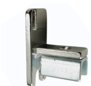
End Cap for Sliding Door Product # BP148140